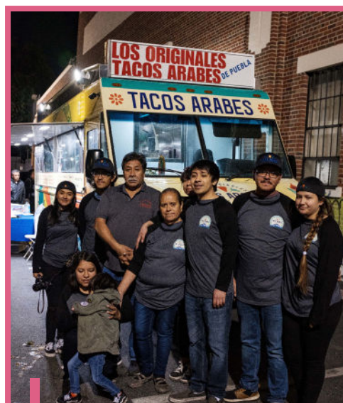
The family of Los Originales Tacos Arabes de Puebla, one of the businesses supported by Inclusive Action's micro-loan fund in Los Angeles, CA.

Food systems are particularly useful in health and community development precisely because many low-income communities have a rich heritage of expertise in food production (over 50% of refugees have agrarian backgrounds) 3 ; calling upon this expertise is an approach to asset-based development. Food and culinary practices are often expressions of cultural identity, and provide ways of engaging all ages and skill levels, lending themselves to inclusive community development in highly-visible ways. Lastly, food enterprises, though requiring capital, are accessible and have relatively low barriers to entry for low-income entrepreneurs. Community food systems work can holistically contribute to multiple elements of a vibrant, healthy community - environment, nutrition, social cohesion, and economic.