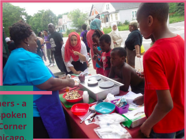
Neighbors at one of IMAN's Corner Store Cyphers - a wellness and healing event featuring music and spoken word at a store participating in their Healthy Corner Store program on the southwest side of Chicago.

Elaboration of EFOD impacts and methodologies for evaluation are ongoing, led by experienced community-based practitioners and supported by allies from philanthropy and academia. A more robust set of impacts and related metrics will be available on www.efod.org , with ongoing updates from our research and development work.