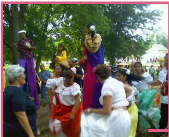
Plenero dancers at Nuestras Raíces' annual Harvest Festival in Holyoke, MA.

There is often overlap between EFOD and the practice of creative placemaking. EFOD initiatives prioritize protecting and preserving the cultural identity of a community, and then celebrating and sharing that culture across communities and generations. EFOD initiatives produce and may sell cultural foods, create shared cultural spaces, construct buildings with strong cultural icons or architectural markers, showcase public art in food production spaces, sell food alongside crafts in markets, and celebrate that cultural identity with vibrant displays of food and arts.