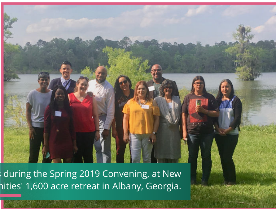
EFOD practitioners during the Spring 2019 Convening, at New Communities' 1,600 acre retreat in Albany, Georgia.

what was at the very heart of their work. The gathering sought to take ownership of the language that bound the group, in part to prevent its co-optation or dilution by conventional developers, funders, or other non-practitioners. This initial meeting led to a series of dialogues, gathering more practitioners and allied stakeholders to document and differentiate their innovative community initiatives from conventional food-based projects. The EFOD Collaborative that emerged has since jointly developed the common values and defining criteria of EFOD work . The Steering Committee of the EFOD Collaborative includes organizations that are both embedded in communities and are also leading national voices such as Mandela Partners (Oakland, CA), Community Services Unlimited (Los Angeles, CA), Detroit Black Community Food Security Network (Detroit, MI), Nuestras Raíces (Holyoke, MA), La Mujer Obrera (El Paso, TX), Inclusive Action for the City (Los Angeles, CA), Planting Justice (Oakland, CA), and Sankofa Community Development Corporation (New Orleans, LA). Self-Help Federal Credit Union, Capital Impact Partners, and the Wallace Center at Winrock International have been key thought partners. It continues to expand with new members and allies.