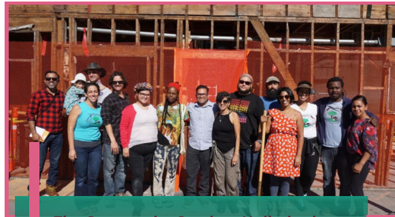
The Community Services Unlimited team at the groundbreaking of the Paul Robeson Community Wellness Center.

EFOD practitioners see a need for leadership development and peer-to-peer exchange that challenges and stimulates their organizations and builds relationships with peers elsewhere in the U.S. While there are organizations represented on the EFOD Steering Committee that are over 25 years old, over 60% in the survey have been founded within the last five years. Practitioner leaders articulated the need for EFOD gatherings to include intentional time for practices to be passed from experienced leaders to younger leaders as well as new ideas to be shared by newer organizations – all fostering mutual learning.